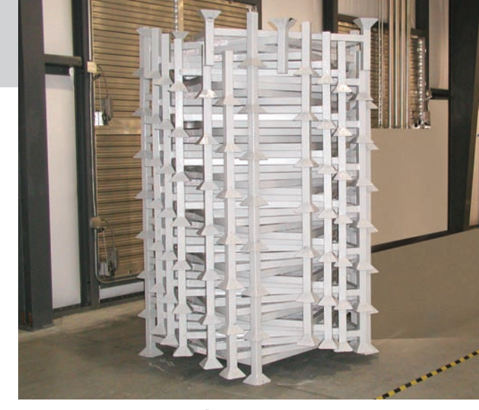
When not in use, Stacker Rack stores densely allowing you to use your floor space as needed