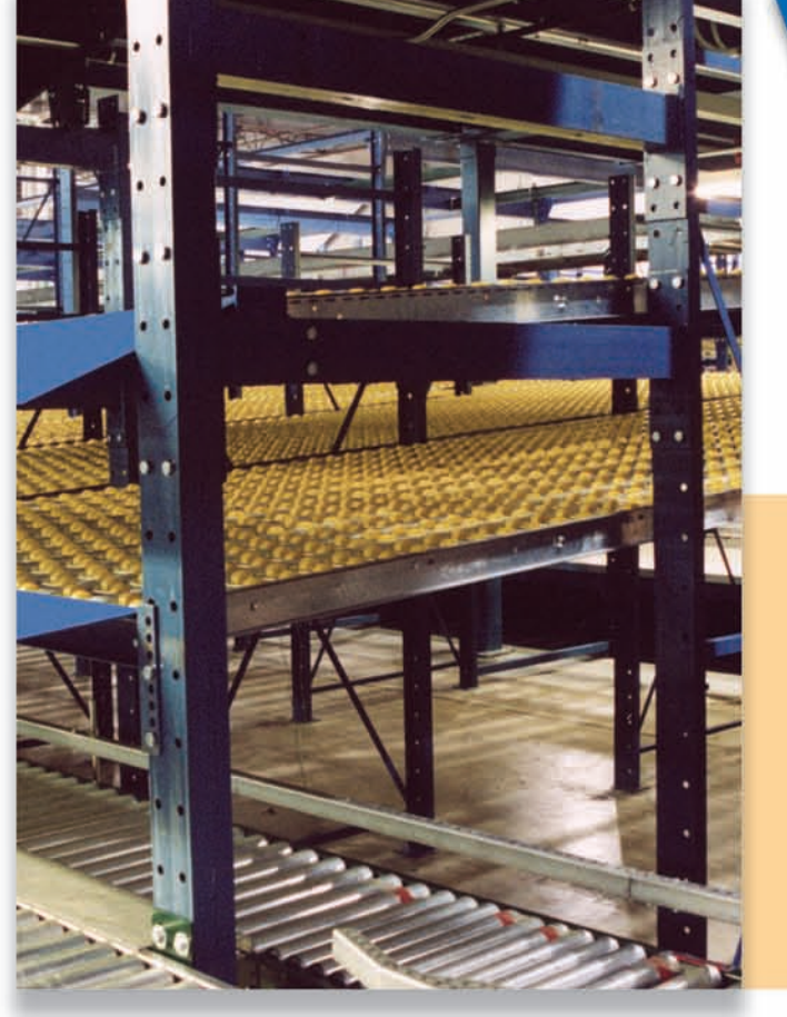
Connectors allow for 1" vertical adjustment

SelecDeck can be installed over existing beams by using extruded aluminum brackets to support the roller deck. As an option, galvanized or painted oval beams can be supplied for ease of label application and reading of labels.