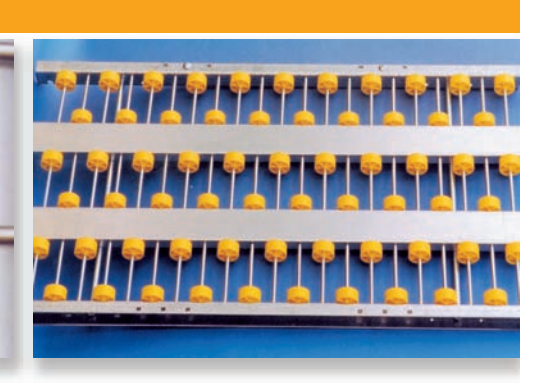
SelecDeck's wheels are staggered for greater support of any size carton and for smoother, more consistent flow.