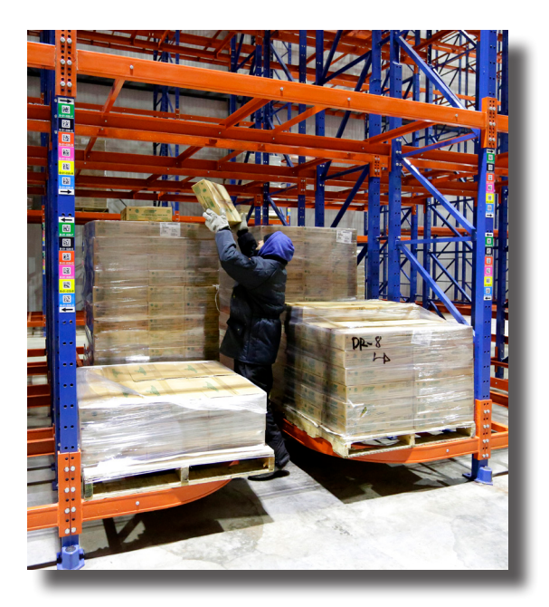
Ergo Deep®: Deep reach rack